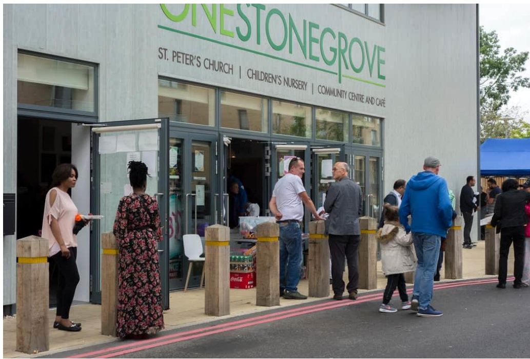
St Peter OneStonegrove , Edgware