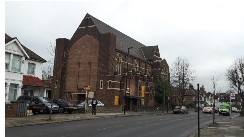
St Gabriel, North Acton 1929-31