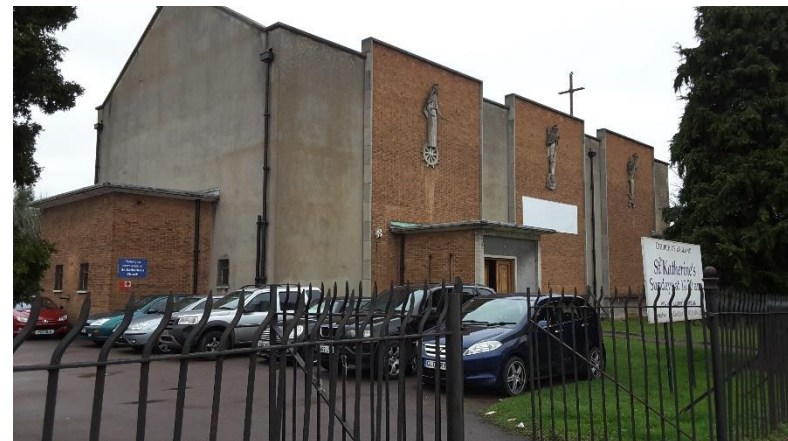
St Katherine, East Acton rebuilt 1958-9