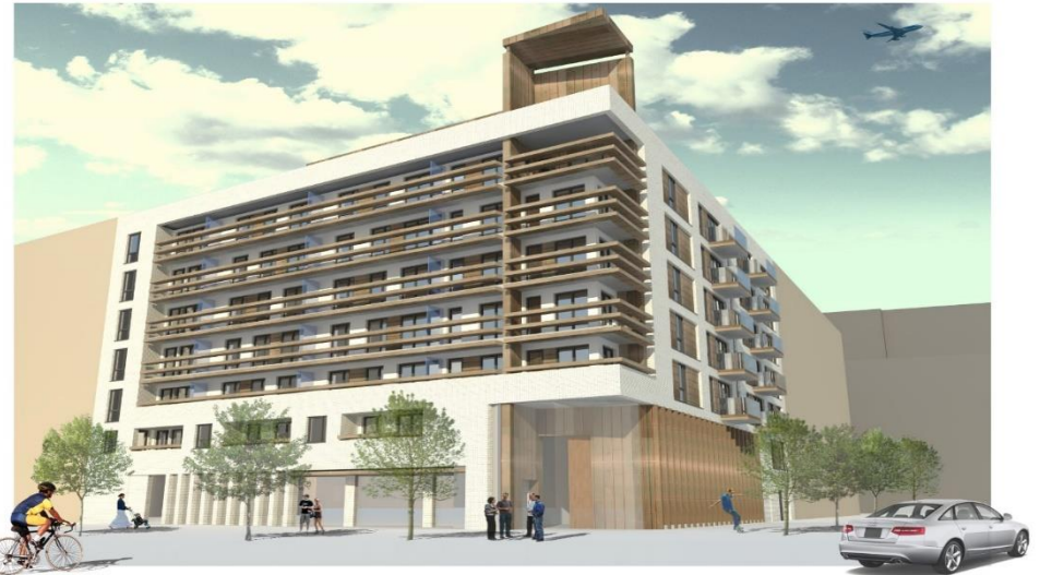
St Francis at the Engine Room, Tottenham Hale