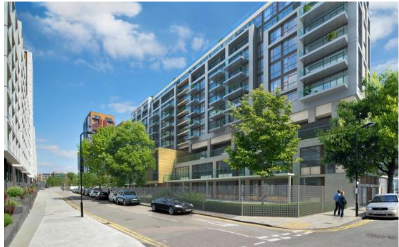
Holy Trinity CoE primary school, Dalston