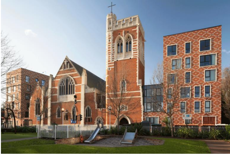
St Mary at Eton, Hackney Wick