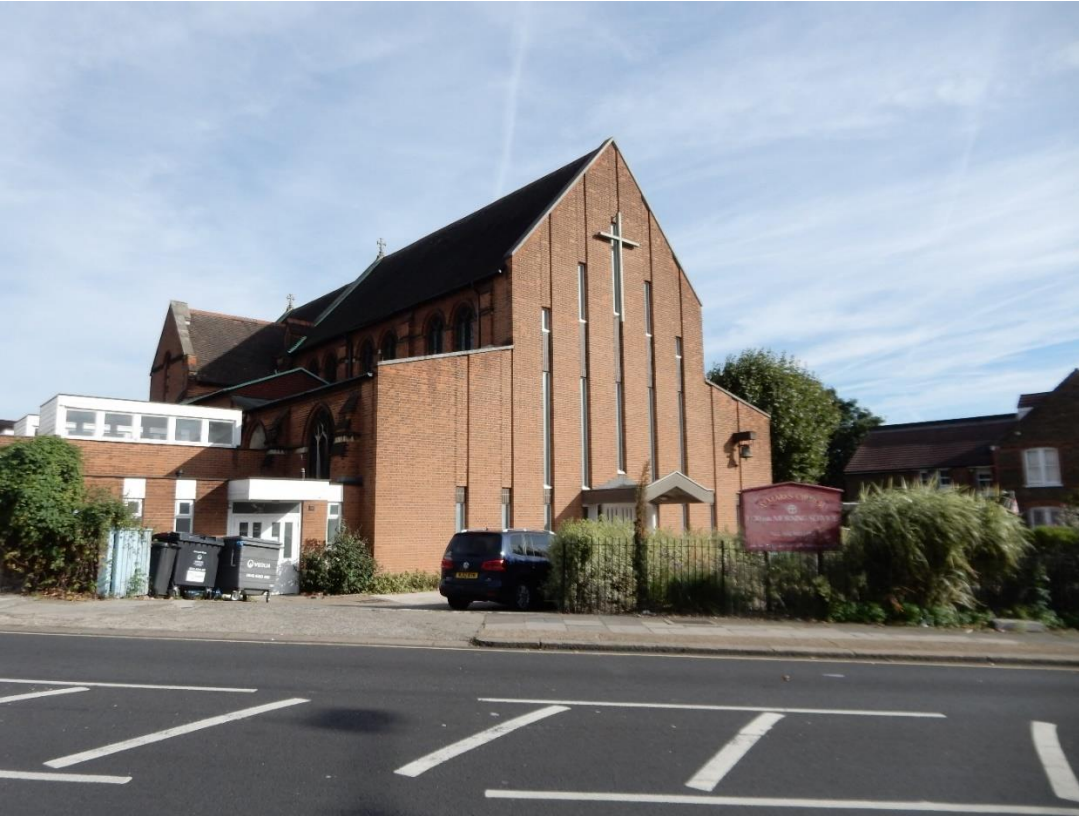
St Mark, Kensal Rise 1914